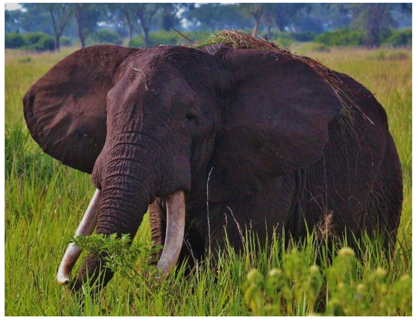
A bull African Elephant with fine tusks decorates his back with grass in Queen Elizabeth National Park.

June 21, Day 9: Bwindi Impenetrable Forest, Ruhija. We will explore the higher altitude forests on this day from our base in Ruhija to search for as many of the special Albertine Rift endemics that we can locate with certain species preferring this upper montane region. This includes a number of scarce species like Handsome Francolin, Red-chested Owlet and Lagden's Bushshrike. Sightings of any of these birds will make it a red-letter day!