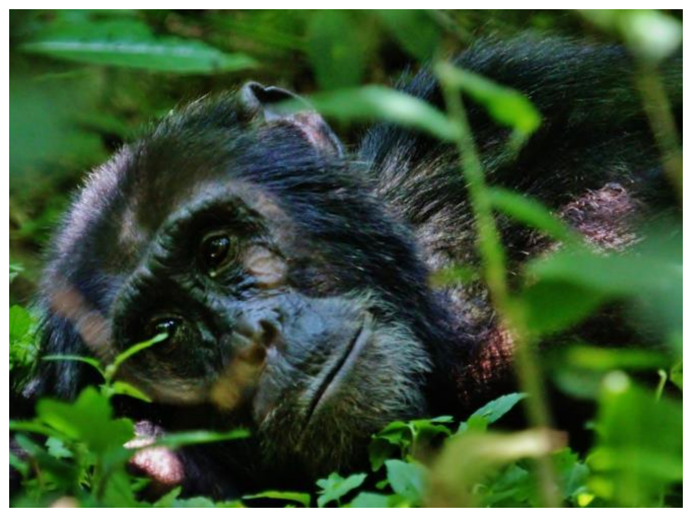
An alpha male Chimpanzee rests on the ground very close to us at Kibale Forest.

June 25, Day 13: Kibale National Park. Birding in Uganda is astonishingly rich and Kibale is no exception. If we are very fortunate, we may be able to track down the elusive Green-breasted Pitta and this will be our main focus this morning. We have chances of finding a variety of birds with some of the notables including African Crowned Eagle, Black-billed Turaco, Narina Trogon, Black Bee-eater, White-headed Wood-Hoopoe, African Emerald Cuckoo, Pink-footed Puffback and Petit's Cuckoo-shrike. It should be mentioned that birding in the forest interior in these giant forests is often quite slow so having plenty of time will be beneficial for trying to track down some of the more elusive species.