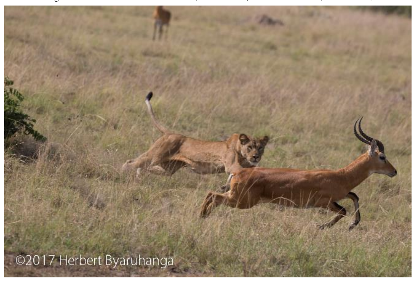
A lioness attempts to bring down a male Uganda Kob in Queen Elizabeth NP. Jacana, Water Thick-knee, African Skimmer, African Pygmy Kingfisher and Black-headed Weaver.

June 23, Day 11: Game Drive in the Park and Boat Cruise on the Kazinga Channel. We will start early at dawn and go for a drive to look for the big game (African Elephant, Cape Buffalo, Leopard, Lion, Topi are all possible) and many excellent birds amidst great scenery. Special birds include African Crake, Marabou Stork, Lesser Flamingo, Bateleur Eagle, Black-bellied Bustard, Red-necked Spurfowl, Senegal Lapwing, Collared Pratincole, Temminck's Courser, Small Buttonquail, Verreaux's Eagle-Owl, Red-throated Bee-eater, Square-tailed Nightjar, Western Black-headed Batis and Sulphur-breasted Bushshrike, to mention a handful. This afternoon, after our lunch at the lodge, we have a boat cruise on the spectacular Kazinga Channel that runs through the park connecting Lake George and Lake Edward. Beyond the hippos and crocodiles are more classic wetland birds including such stunners as Great White Pelican, Little Bittern, Saddle-billed Stork, Black Crake, African