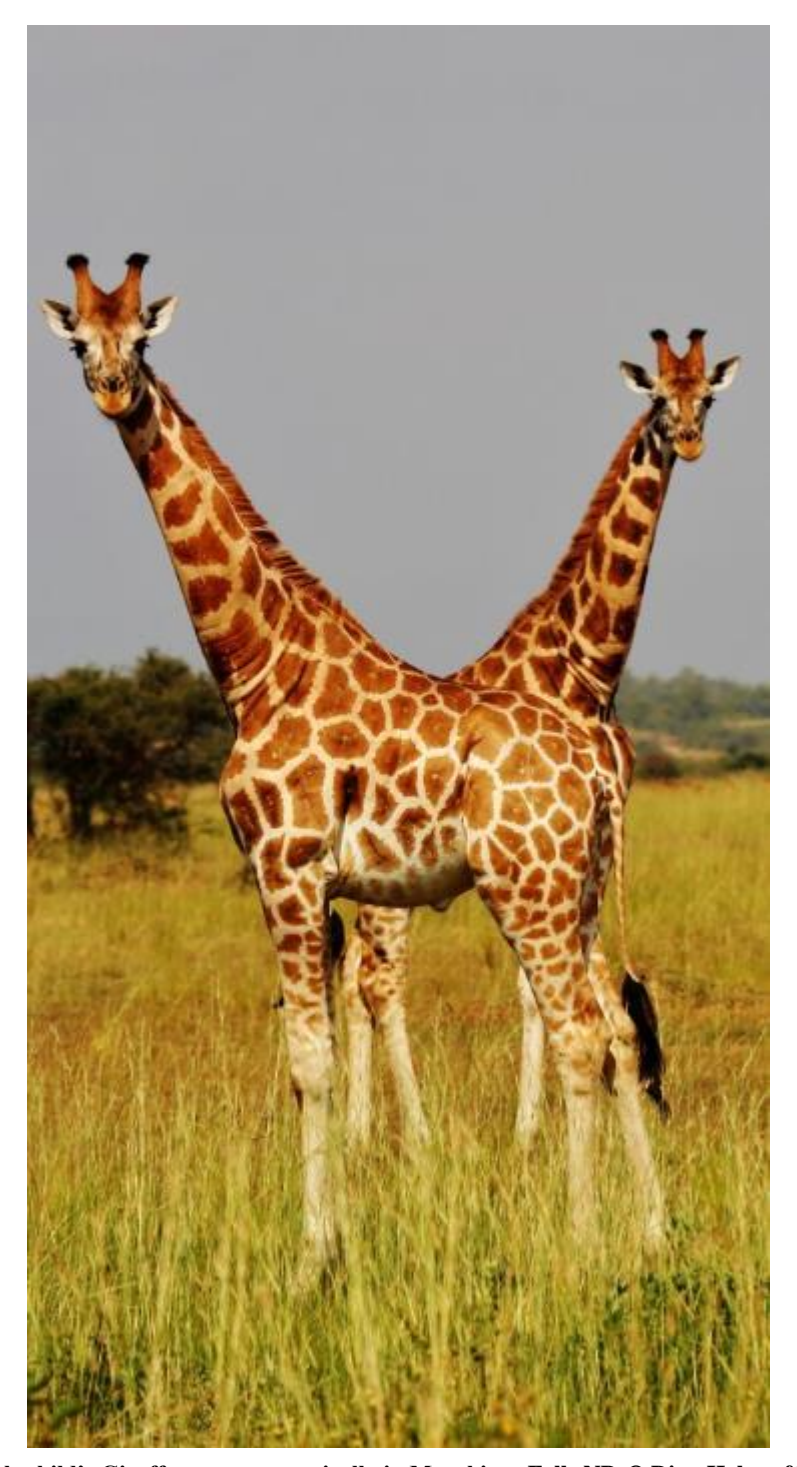
Rothschild's Giraffe pose symmetrically in Murchison Falls NP.

Leopards, elephants, Giraffes, buffalo, hartebeest, oribis, Uganda Kob and Patas Monkey.